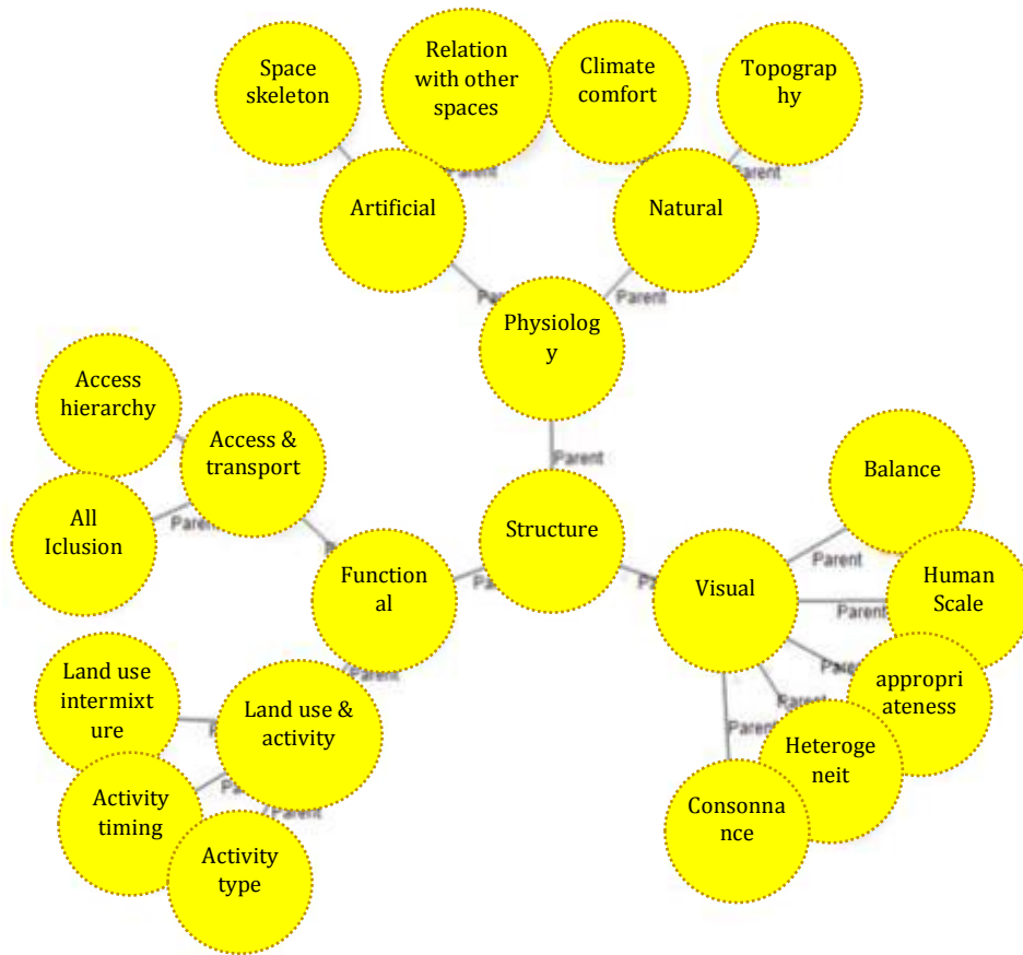
Figure 4) codes and sub-codes of the component "structure"